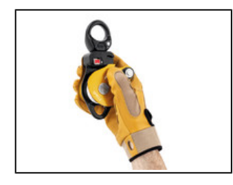
Triple-action opening of the moving side plate is quick and easy, even with gloves.

Openable even when attached to the anchor, the SPIN L2 is a double pulley designed for maximum simplicity when setting up hauling systems or tyroleans. The two parallel-mounted sheaves and auxiliary attachment point allow the pulley to be used for setting up various types of complex haul systems The large diameter sheaves mounted on sealed ball bearings provide excellent efficiency The swivel facilitates handling, allowing the pulley to be oriented under load, and direct connection of carabiners, ropes or slings.